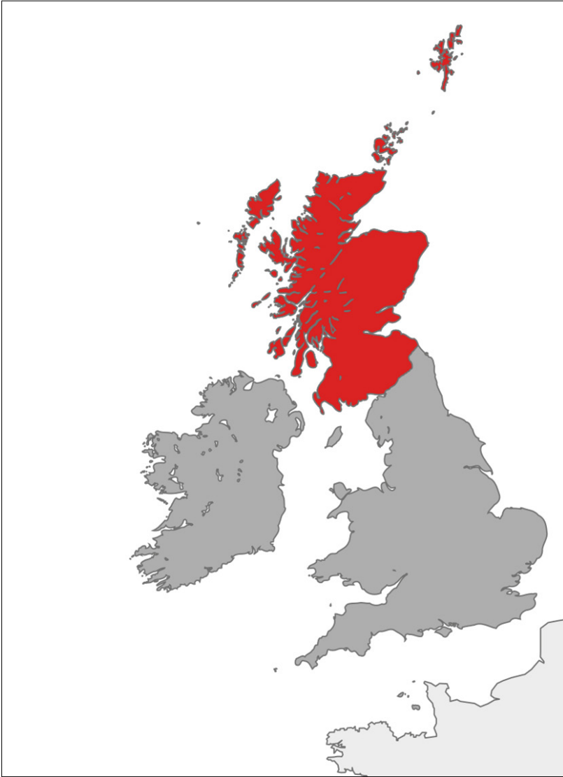
Figure 1 Map showing the area of Scotland in relation to Great Britain and Ireland. (Source: Wikimedia Commons: The Free Media Repository – By Cnrb – Own work, 2007).