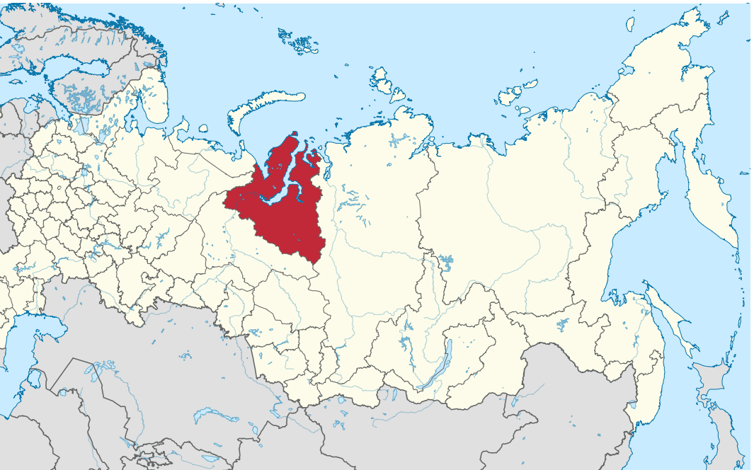
Figure 1: The Yamalo-Nenets Autonomous Okrug on the Map of Russia

Nenets, Khanty, and Selkup are the native languages of the indigenous population in the Yamalo-Nenets autonomous okrug (district, hereafter referred to as the YNAO). The district is situated in Western Siberia, on the eastern side of the Ural Mountains in the Russian Federation. The YNAO was established by a decision of the highest executive board in the Soviet Union Government on the 10 th of December 1930. In 1977, the district's legal status was changed to autonomous and after the collapse of the Soviet Union the YNAO became a subject of the Russian Federation. The Nenets are officially recognised as the main ethnic group in the YNAO. Next to the Nenets, the Khanty and Selkups are also officially recognised as the indigenous inhabitants of the district under the 1998 Ustav YNAO (Osnovnoi zakon) Yamalo-Nenetskogo avtonomnogo okruga (Charter of the Yamalo-Nenets Autonomous District).