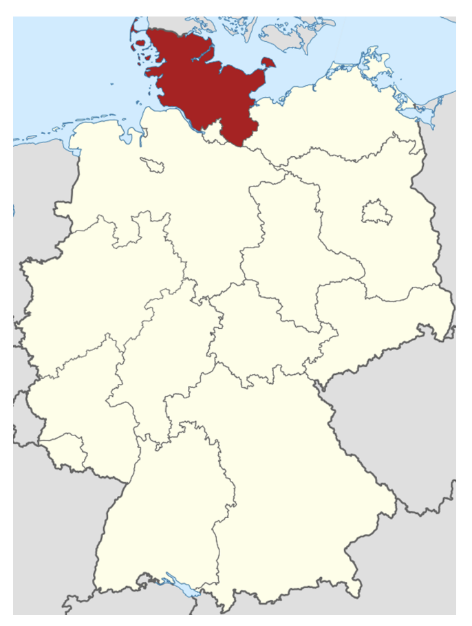
Figure 1: Locator map of Schleswig-Holstein in Germany

then shrinking to max. 6,000 persons during World War II due to voluntary and coerced assimilation (Henningsen, 2013).