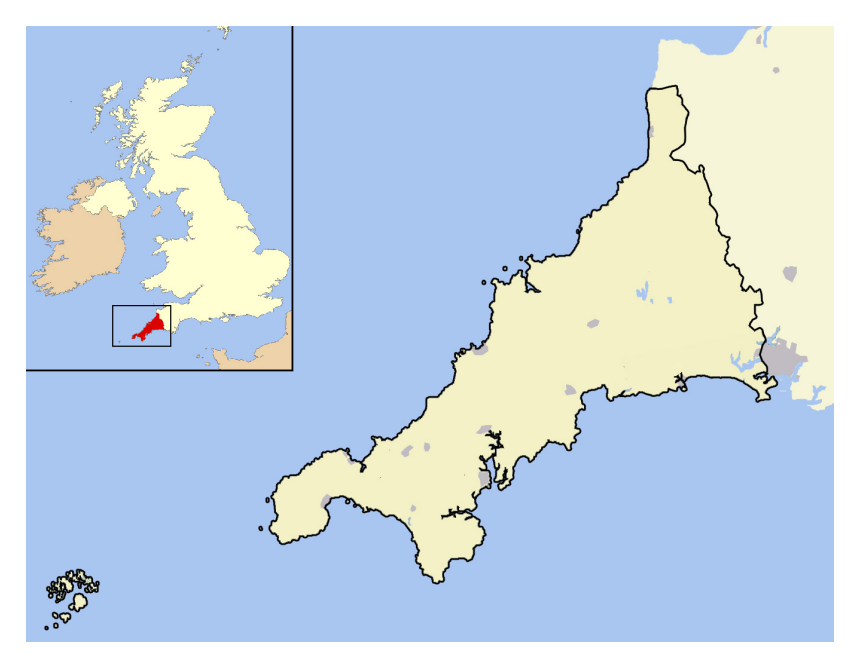
Figure 1: Geographical location of Cornwall in the UK (2008).

picture of what the language might have been like (Sayers & Renkó-Michelsén, 2015, pp.23–24). From the 18<sup>th</sup> century onwards, those few remains were pored over by a small number of enthusiasts and philologists with varying levels of linguistic training, increasingly with a view to filling the many gaps in the lexicon and grammar in order to reconstruct a full language. The late 19th century Celtic renaissance saw the founding in 1901 of the Celtic-Cornish Society, Cowethas Kelto Kernuack (Mills, 1999, p.46), superseded in 1920 by the Old Cornwall Society, which grew into the Federation of Old Cornwall Societies. In 1928, the Cornish Bardic Assembly (Gorsedh) formed, with twelve Bards and a Grand Bard. In 1967, the Gorsedh and the Federation founded the Cornish Language Board, Kesva an Taves Kernewek, to facilitate Cornish learning and formalise the examination process. In 1979, in order to focus its efforts on the formal work of exams, the Board founded the Cornish Language Fellowship, Kowethas an Yeth Kernewek, to conduct